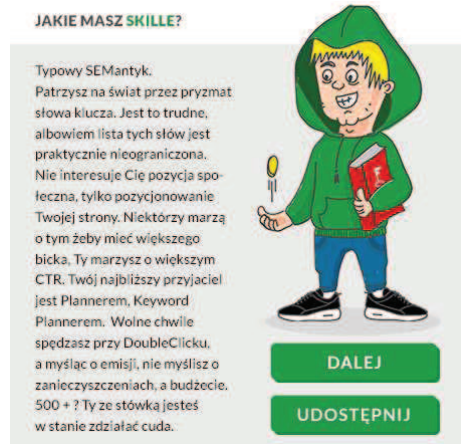
Figure 6. One of the dedicated Qualification Quiz results.

Translation: WHAT ARE YOUR SKILLS? A typical SEManticist. Your angle to view the world is through keywords, which is a difficult task, as their list is virtually endless. You're not interested in your life optimization, but only in your Search Engine Optimization. Some dream of higher BIC, and you dream of higher CTR. Your best friend is a Planner, a Keyword Planner. You spend your free time with DoubleClick and the only casting you're interested in is broadcasting, meaning money. You and one hundred zlotys can do wonders. NEXT SHARE