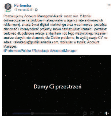
Figure 1. Recruitment announcement, 17 March 2017

Translation: We're looking for an Account Manager! If you have at least 2 years of experience at a similar position in an interactive or marketing agency, if you know the world of digital marketing and e-commerce, if you know how to plan and coordinate projects, if you make contacts easily and can build long-term relations with the customers and, on top of that, counting and data analysis are just right up your alley, send your resume to the address: rekrutacja@publicismedia.com, subject: Account Manager.