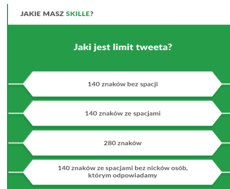
Figure 5. Exemplary questions taken from the Qualification Quiz

Below there is an analysis of the case study of Performics (Publicis Media) and a visualisation of recruitment posts placed on Facebook, complete with translations into English. All recruitment posts were addressed to people aged 20–35 (Generations Z and Y) from Warsaw. Additionally, the campaign was narrowed down to people interested in digital marketing and