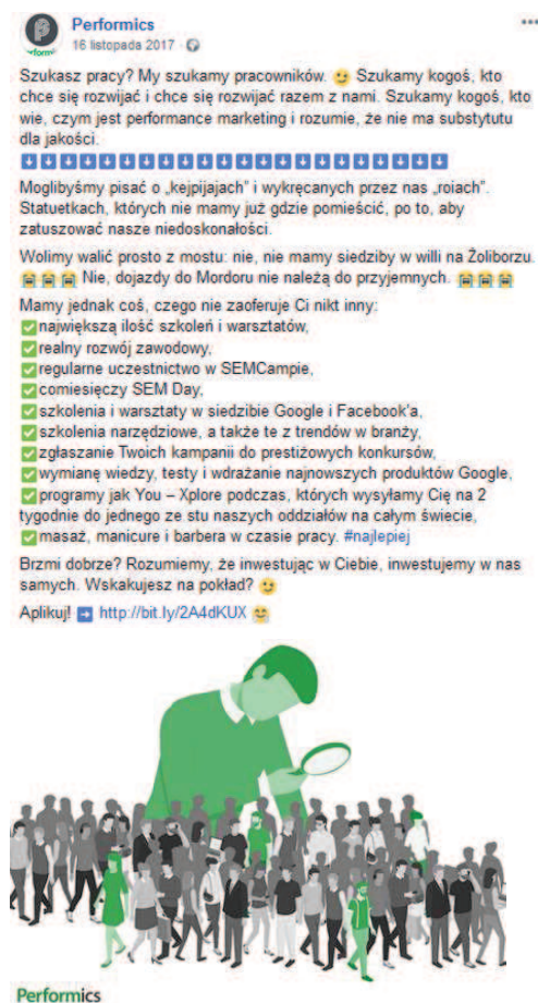
Figure 3. Recruitment announcement, 16 November 2017

Translation: Are you looking for a job? Because we're hiring. We're looking for someone who wants to develop and wants to do it with us. We're looking for someone who knows what is performance marketing and that quality cannot be replaced.