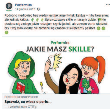
Figure 4. Recruitment announcement by Performics, 14 December 2017

Translation: They say that a media person lacking knowledge is like an Argentinian cactus – supposedly priceless, but still a cactus. Check out your skills in our quiz. We won't tell you what type of ham you are, but it's always worth knowing if your knowledge has not changed into a Christmas pudding.